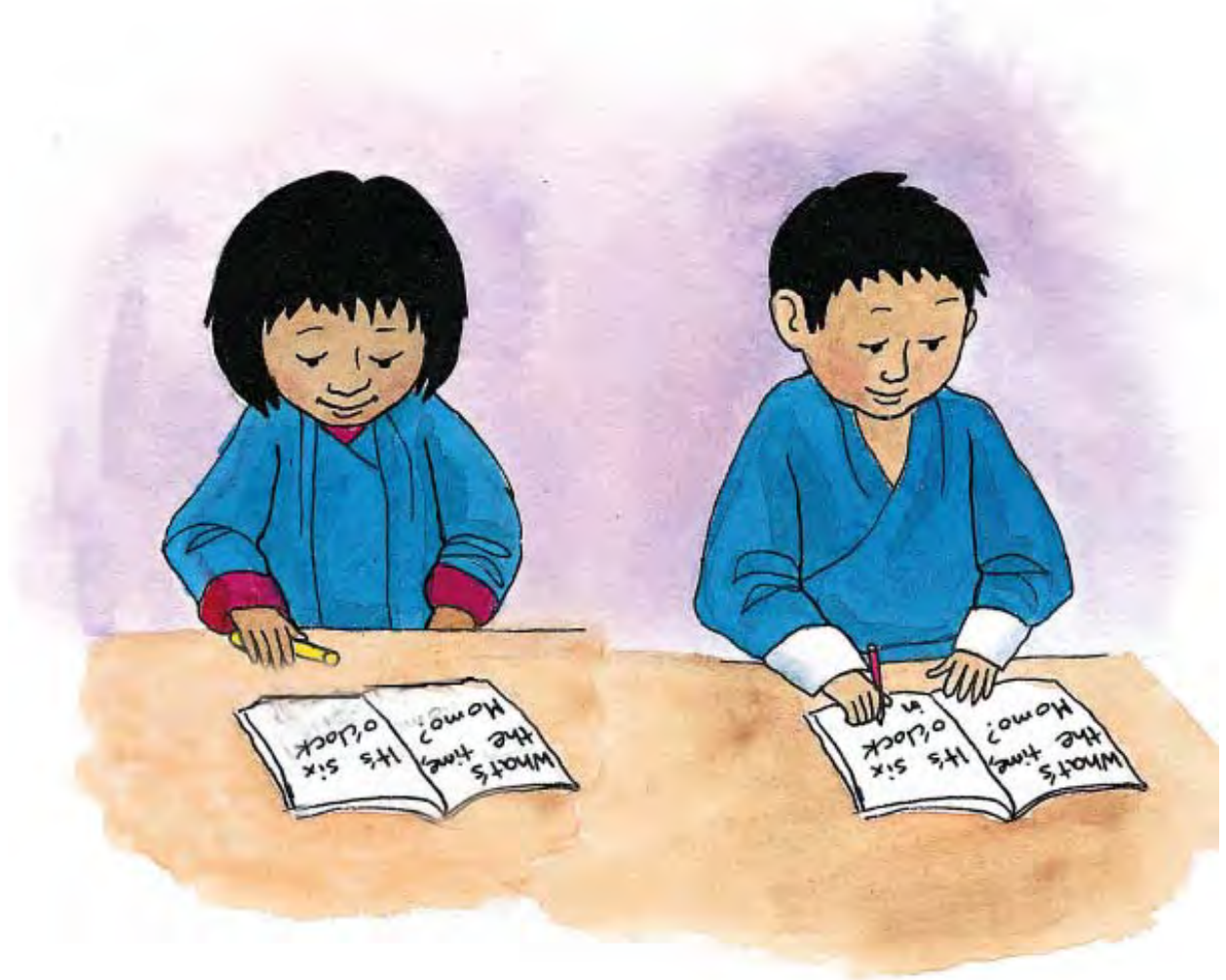
Dechen and Dorji read and write English.