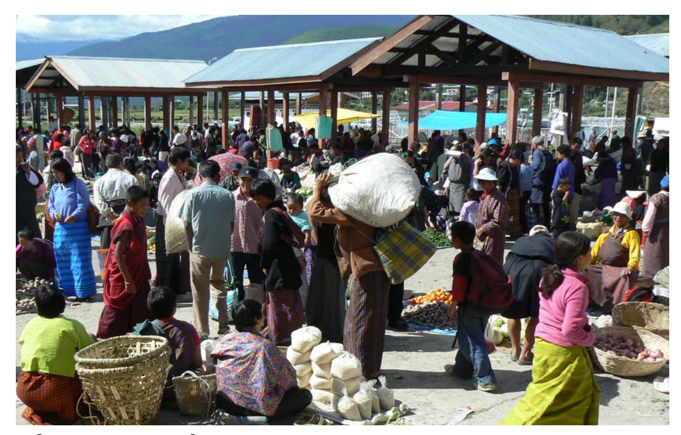
This is a market in Paro. There are lots of things to buy.