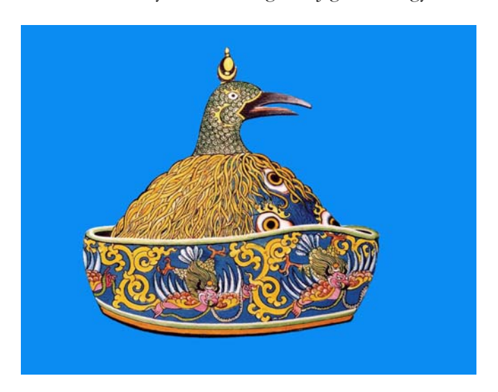
Fig. 1.2. The Raven Crown

Further more, the Lam designed the Raven Crown and offered it to Jigme Namgyal after blessing it with the special protecting powers of Legon Jarok Dongchen (auxauqua after blessing), the Raven-headed Mahakala. He also advised Jigme Namgyal to dress in black clothes, black shoes and ride on a Ta nag Ting Kar ( कृष्णक्षणक्ष ), a black horse with white hoofs, for which he is also referred to as Deb Nagpo ( क्ष्रिया क्ष्मणक्ष ), the Black Regent. This would ward off any evil forces against Jigme Namgyal.