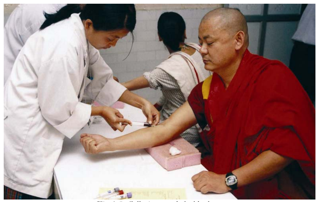
Fig. 3.5. Collecting sample for blood test.

and Dagapela when the first Five Year Plan began in 1961. As there were only few Bhutanese doctors and paramedics, the hospitals and dispensaries were all staffed by expatriate doctors and nurses. With the opening of Thimphu Hospital in 1961 followed by Samtse, Trashigang, and Gelephu district hospitals as well as several dispensaries the infrastructure development began. The real expansion of infrastructure began only in the 1980s with the emphasis on the Primary Health Care approach, which was propounded at the Alma Ata declaration in 1978, to which Bhutan is a signatory.