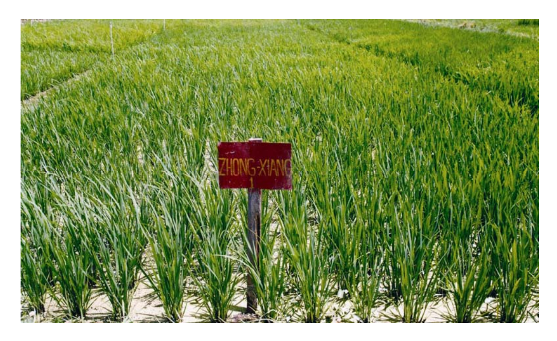
Fig. 3.6. Experementing a new variety of rice at the RNR-RC at Bajothang

Today, agriculture practices are in a transitional phase from a subsistence practice to a market oriented system. This change is propelled by the support provided by the diverse agencies of the Department of Agriculture. Some of the contributions are in the production of high yielding varieties of crops. For instance, local red rice yield was only 4 tons per hectare while a modern variety known as Bajo Maap-1(CARD21-10-1-13-2-1) yielded 6.58 tons per hectare. Similarly, local maize that yielded only 3 tons per hectare is replaced by Khangma Ashom-1 (Swan-8528) with a yield of 5 tons per hectare. Double cropping of rice has picked up in many warm and hot zones of Bhutan.