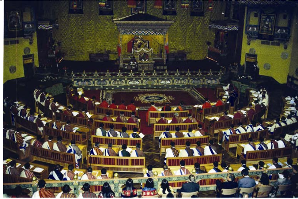
Fig. 2.1. The National Assembly

"It has been my endeavour to encourage and prepare our people to participate actively and fully in the decision making process of our country. The time has now come to further promote the people's participation in the decision making process. Our country must have a system of government, which enjoys the mandate of the people, provides clean and efficient governance and has an in-built mechanism of checks and balances to safeguard our national interests and security. As an important step towards achieving this goal, the Lhengye Zhung Tshog, should now be restructured into an elected Council of Ministers that is vested with full executive powers to provide efficient and effective governance of our country."