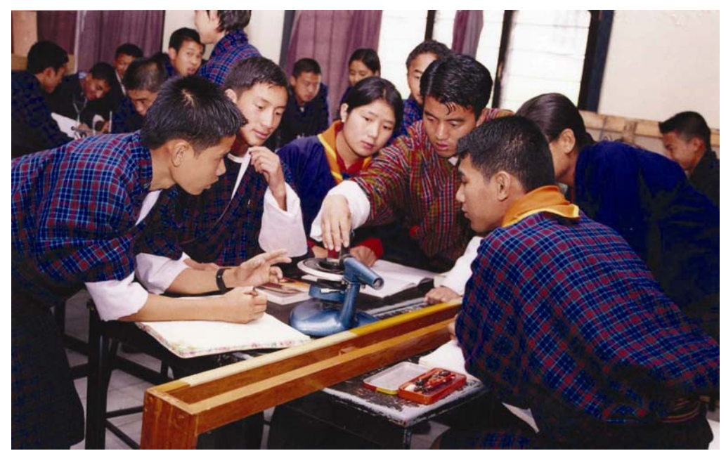
Fig. 3.3. Students observing a demonstration of Physics practical

The introduction of a School for Deaf Children at Drugyal Lower Secondary School in 2003 in Paro is a milestone. The establishment of a special education resource unit at Changangkha Lower Secondary School under the personal initiative of Her Majesty the Queen Ashi Tshering Pem Wangchuck, the President of the Youth Development Fund, marked another effort of integrating disabled children in the mainstream education. Multigarde teaching is gaining importance in remote villages in the attempt of achieving Education For All (EFA).