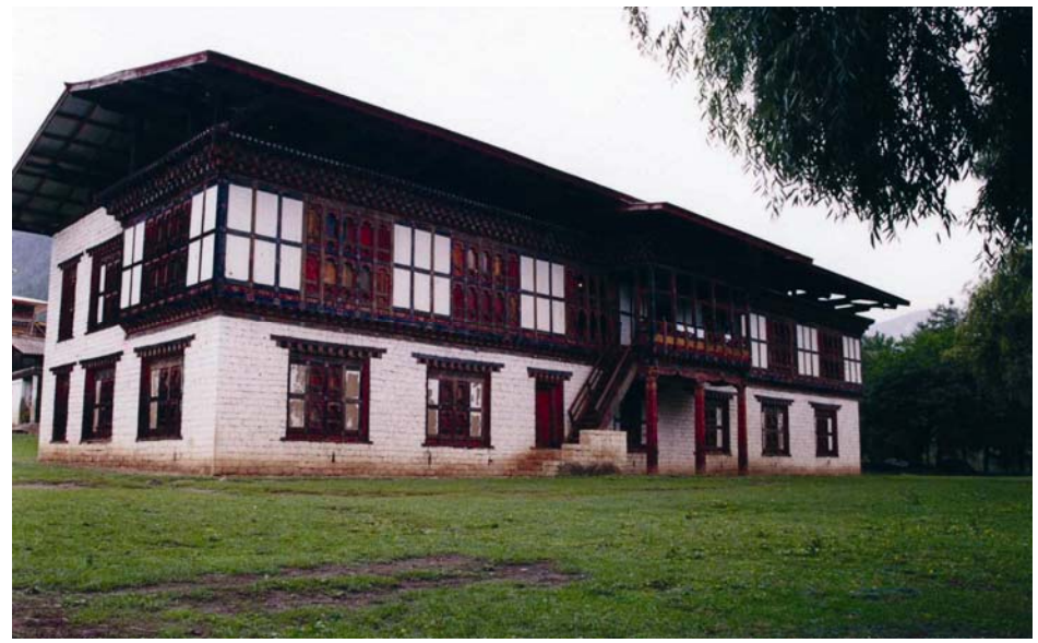
Fig. 3.2. The Ugyen Wangchuck Academy at Paro

Druk Gyalpo Jigme Wangchuck continued with the modern education system but in fact the glorious chapter of modern education began in 1952 with the ascendancy to the throne of Jigme Dorji Wangchuck. With the start of the First-Five Year Plan in 1961, Modern Education was accorded one of the highest priorities. Of the total outlay of Ngultrum 100 million, the Education sector was given 10 million. Over the decades, the student enrollment grew from a handful of students to about 1,500 and from a single school in 1914, it grew to 59 schools by 1959.