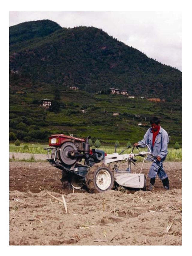
Fig. 3.7. Mechanzied Farming

The yeild of oil seeds like mustard does not meet the requirement and a significant amount is imported from India. However, efforts are underway to promote the production of oilseeds also.